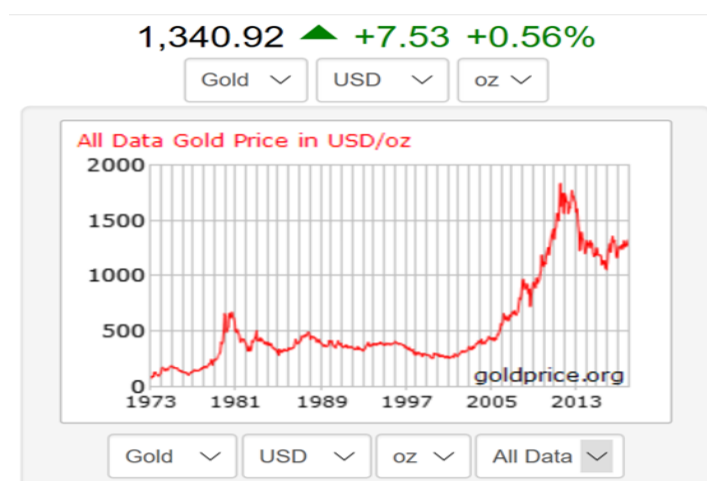
Figure 1. Gold Price Scales . https://goldprice.org/de/gold-price-history.html 1

History clearly shows this - Another recession is inescapable.